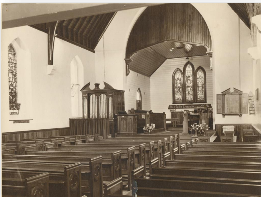
All Saints 75 years ago, in 1949, showing timber chancel, choir and pulpit. The pipe organ was moved in the 1960s to its current place in the gallery.

It is also a mistake to think that buildings of the past were built to last and easy to maintain. Generations of churchwardens have worried about everything from the inadequate drains to the slate roof, which has undergone major works several times over. At one stage the external buttresses were declared unsafe by the Department of Health, and had to be re-mortared at great cost.