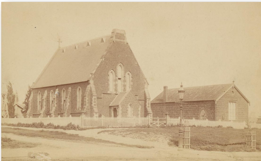
All Saints in about 1885, showing gas street lighting and the elms of High street only recently planted

It was 25 years before the site was even cleared for the great project of St Paul's Cathedral, a building venture that took decades, and where the foundation stone was not laid until in 1889. It was 28 years before the Town Hall and Post Office were built, and 30 years before Northcote was proclaimed a town. When Northcote came into being, All Saints had been here for a generation.