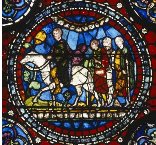
On the road to Canterbury: pilgrims depicted in a window of Trinity Chapel, Canterbury Cathedral.