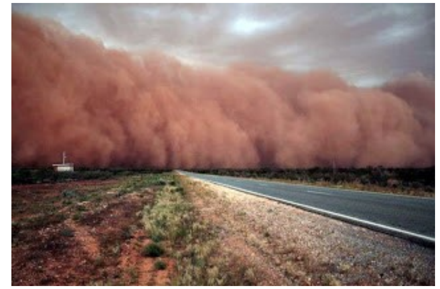
A red dust storm on its way to Broken Hill, 2009

'frightened children sat in petrified silence, not knowing what was happening... ''It's the end of the world, Girlv!'"