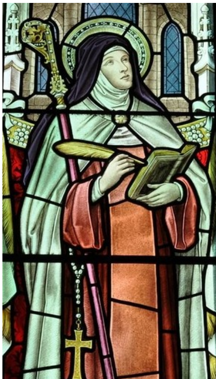
Saint Teresa of Avila, 1515–1582 Spanish visionary and ecstatic, who believed in prayer and its effects on our actions, founder of the order of Discalced (barefoot) Carmelites.