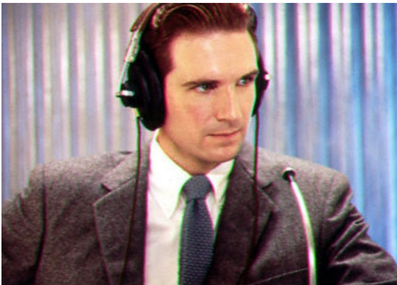
Ralph Fiennes in Quiz Show , as the soon to be disgraced Charles van Doren.

Quiz Show is a reminder of the power and pitfalls of religious identities in a secular society. Without giving too much away, what is so clever about the movie is that not only does it infer how the protestant identity has historically won, but how positions of power and influence also ultimately come undone.