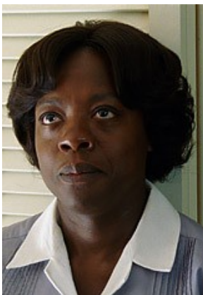
Viola Davis was nominated for an Academy Award for her performance in The Help , 2017.

Another disturbing movie in the same genre is The Help , also set in the 1960s and terrifyingly portraying life in the deep south of the US, where black maids were employed in well-to-do households sometimes over several generations. The maids were often responsible in loco parentis for caring for the children of bored and well-heeled white women. It feels odd that the same people preparing meals and looking after the children would be prohibited from using the same bathrooms as the household. They were expected to use their own bathroom.